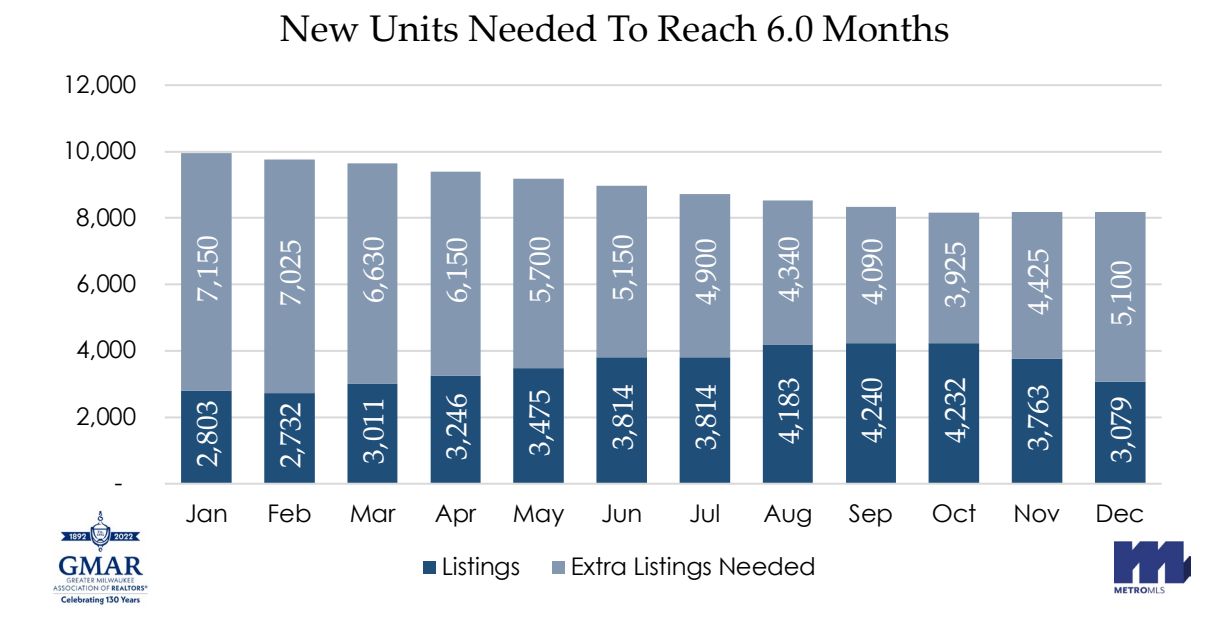
With 3,079 current listings providing 2.3 months of inventory, the market would need an additional 5,100 units to push inventory to six months. Six months of inventory is considered a "balanced" market. If inventory falls below six months, the market favors sellers, and when inventory exceeds six months, it is a buyer's market.

Seasonally adjusted inventory tells us how many months it would take to sell the existing homes on the market. The seasonally adjusted inventory level for December was 2.3 months. Subtracting listings that have an "active offer" from those available for sale (about 80% of listings with an offer sell) yields 2,344 listings , which equals 1.1 months of inventory .